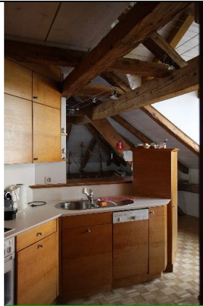
Powered by EXPOSE 7 www.node.de