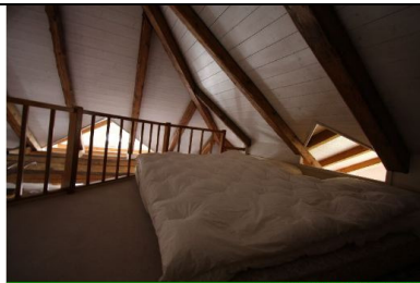
Powered by EXPOSE 7 www.node.de