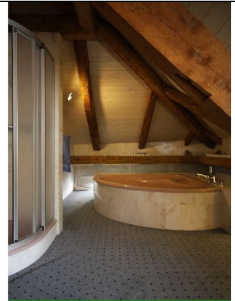
Powered by EXPOSE 7 www.node.de