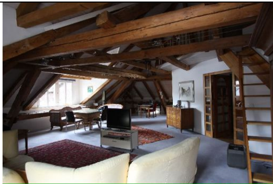
Powered by EXPOSE 7 www.node.de