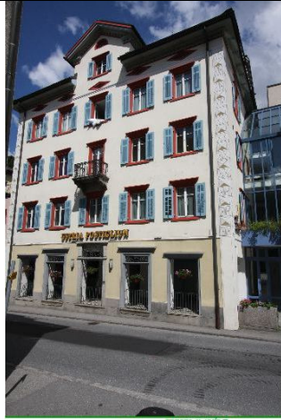
Powered by EXPOSE 7 www.node.de