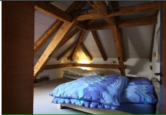
Powered by EXPOSE 7 www.node.de