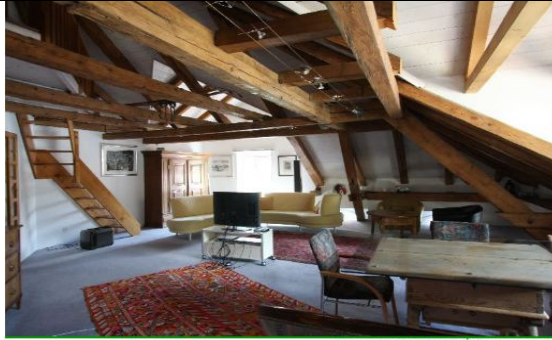
Powered by EXPOSE 7 www.node.de